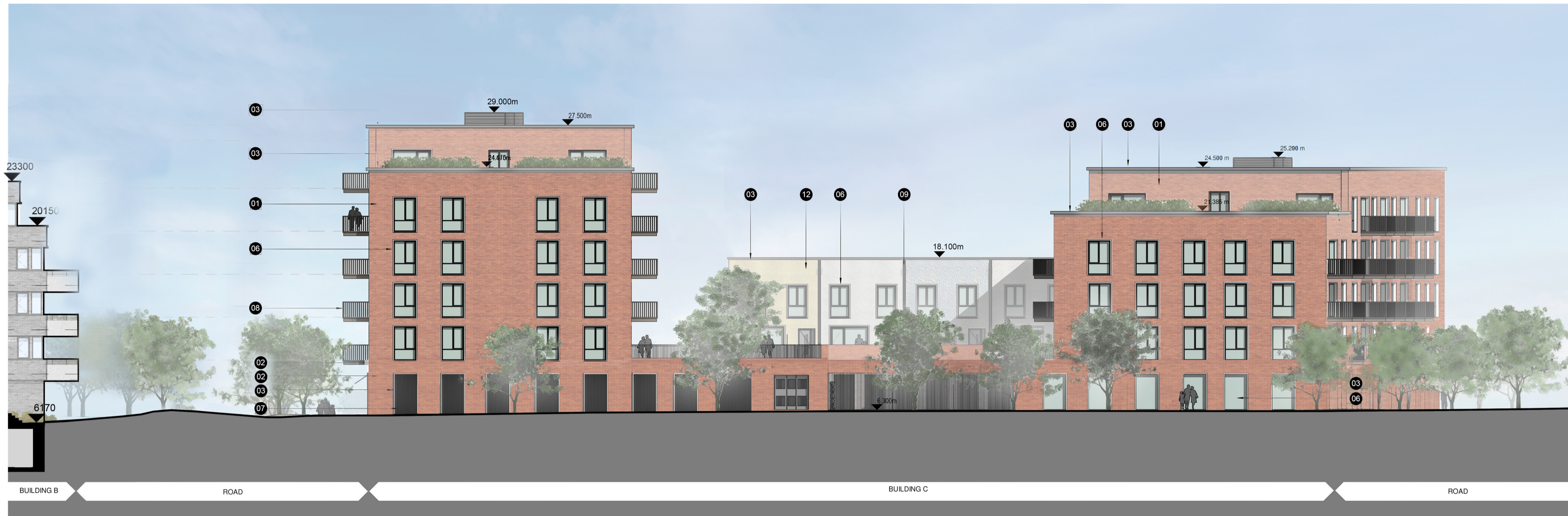
North Elevation Scale:1:200