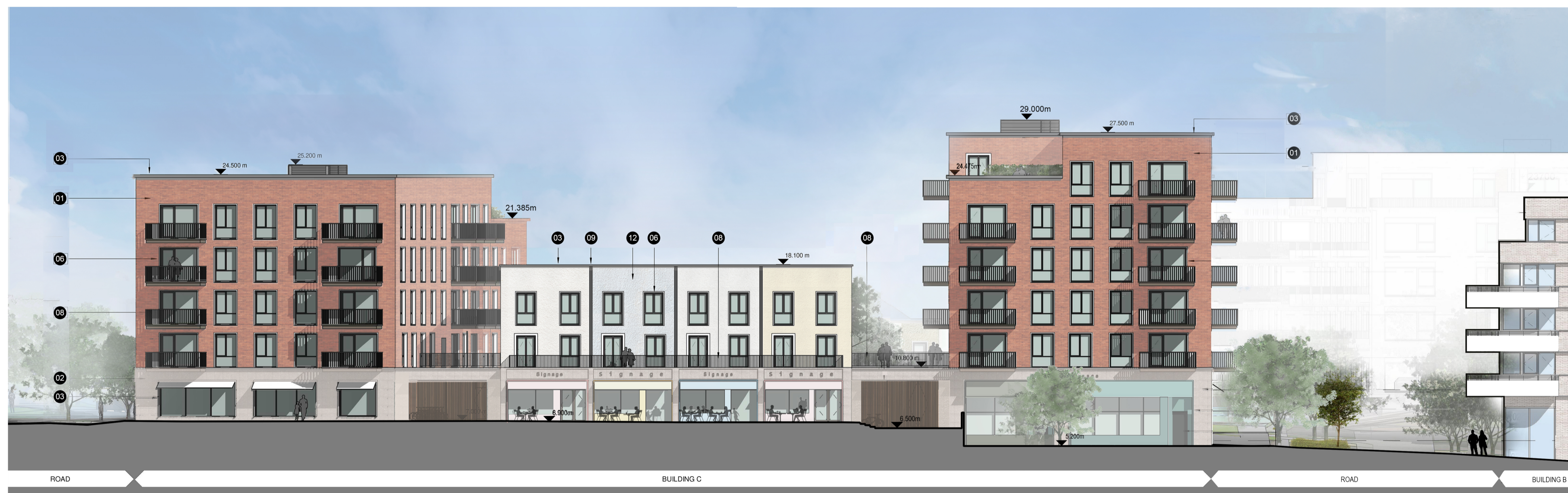
South Elevation Scale:1:200